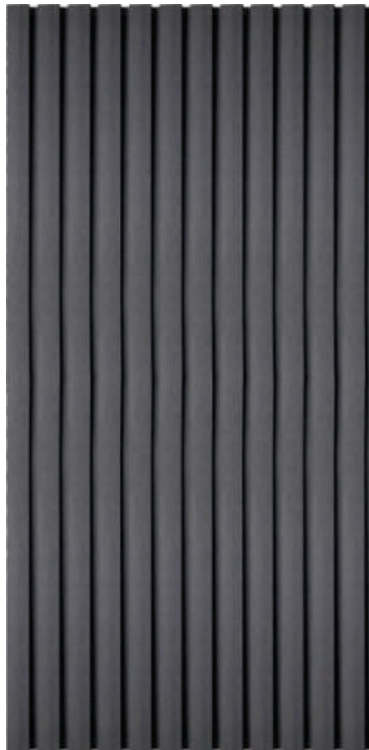
EW02 METAL GREY WOOD