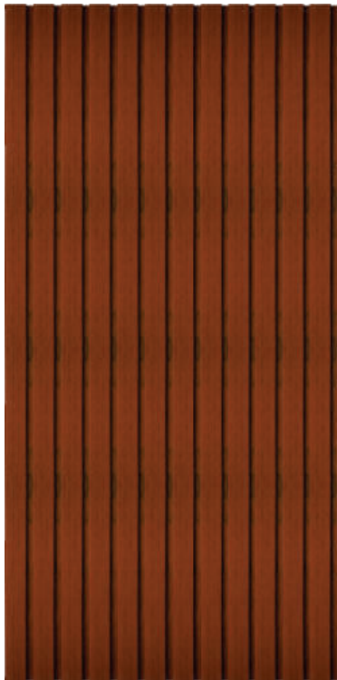
EW01 GREEN HEART WOOD