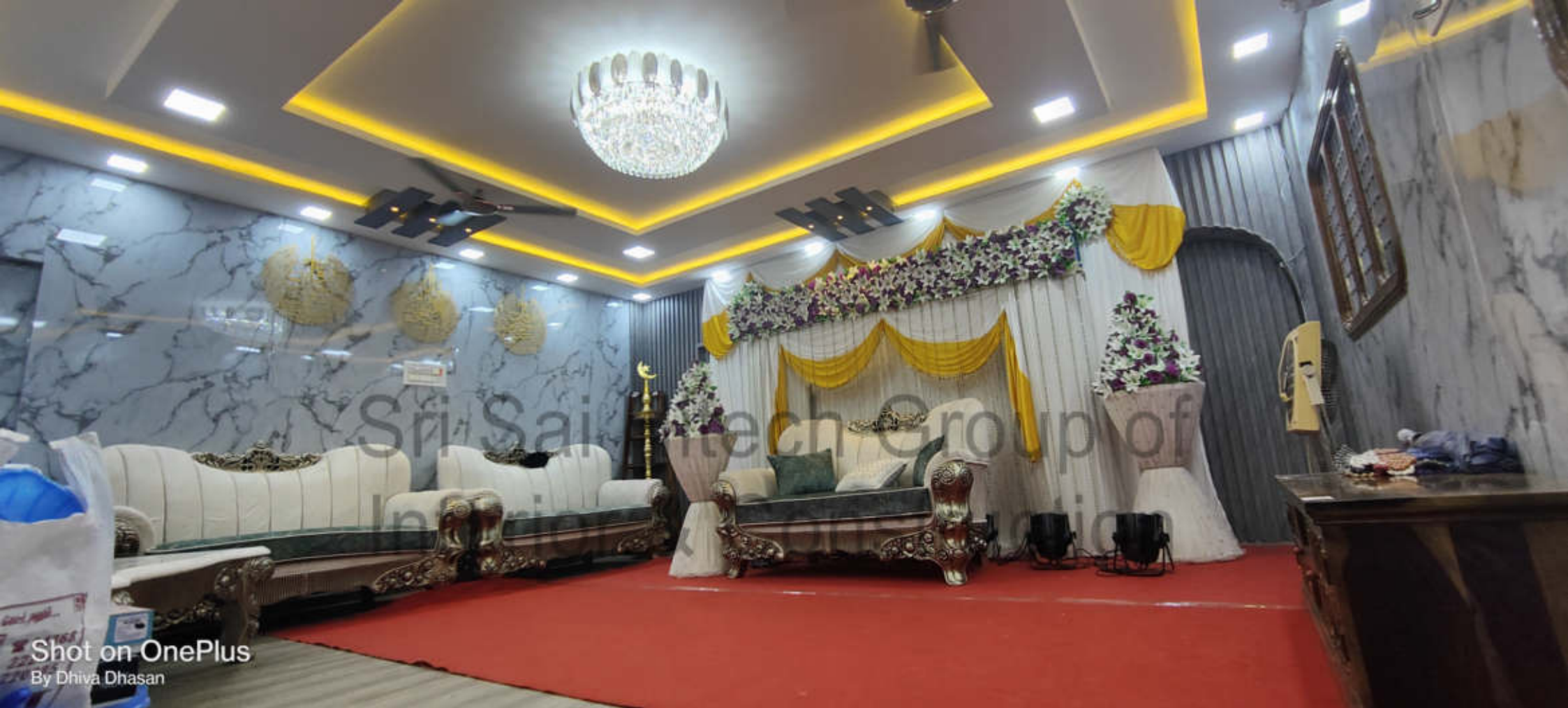
Shot on OnePlus By Dhiva Dhasan